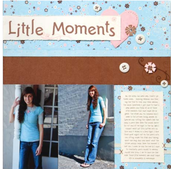
Artwork shown uses supplies from the Best option.